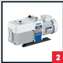
Oil bath pump