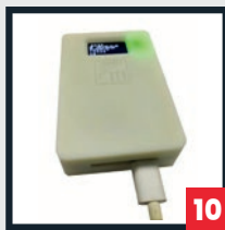
Wifi communication module