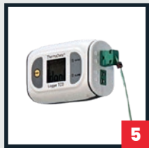
Data logger with 2 channels