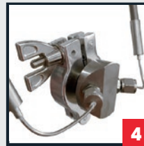
Adaptor for 2 or 4 probes