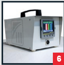
4-way portable recorder with graphical screen