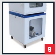
Raising furniture with feet or castors