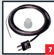
Thermocouple J probe