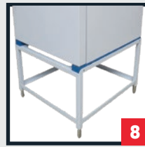
Subframe with feet or castors